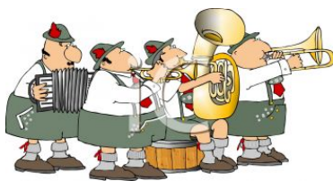
The Sisters of St. Joseph