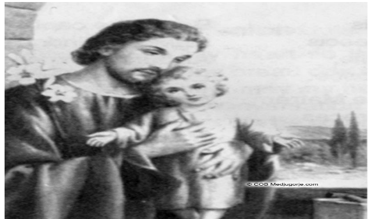
ST. JOSEPH, PRAY FOR US!

Please join us Friday, March 19 at Sacred Heart for Stations of the Cross followed by Holy Mass. We will pray the Litany in honor of St. Joseph as well. Please feel free to bring flowers to honor St. Joseph that day.